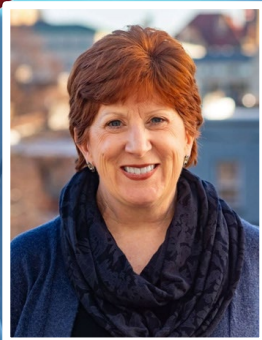
WELCOME ADDRESS MAYOR KATHY SHEEHAN CITY OF ALBANY, NY